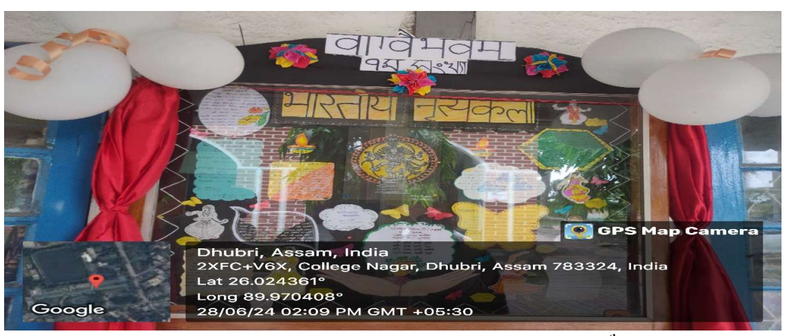
Wall Magazine-VAGVAIBHAVAM- 7th Issue